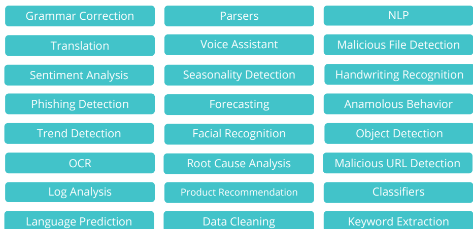
Figure 1: Breadth of AI Work at Zoho

Zoho has actually been working on a variety of use cases for AI for 10 years and it has indeed insinuated itself throughout the apps (Figure 1).