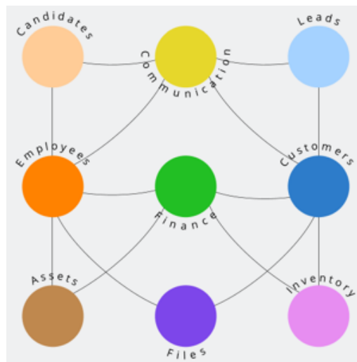
Figure 2: Seamlessly Integrated Unified Data Model

For its apps, Zoho strictly adheres to a single, unified data model. The data itself is organized into pillars and files, which intuitively align to different aspects of your business, but they are all interconnected.